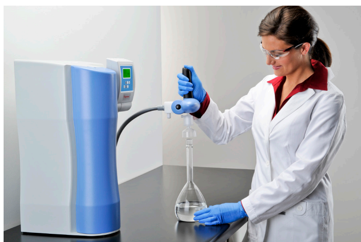
The Thermo Scientific™ Barnstead™ GenPure™ Pro water purification system delivers ultrapure water up to 24 inches from the unit with its flexible dispenser.

There are two different types of water that are acceptable for HPLC eluents: bottled HPLC grade water or ASTM Type 1