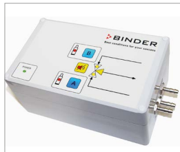
CO 2 gas tank changer