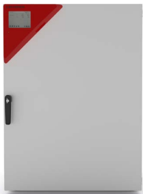
Model CB 260 Sizes 56, 170, 260 L