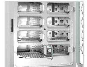
Divided partitions for Cell Therapy

Distributed by Fisher Scientific. Contact us today: