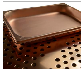
Copper interior fittings