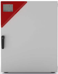
Model CB-F 170 Sizes 170, 260L