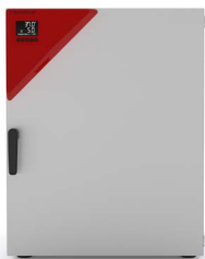
Model CB-S 170 Sizes 170, 260 L